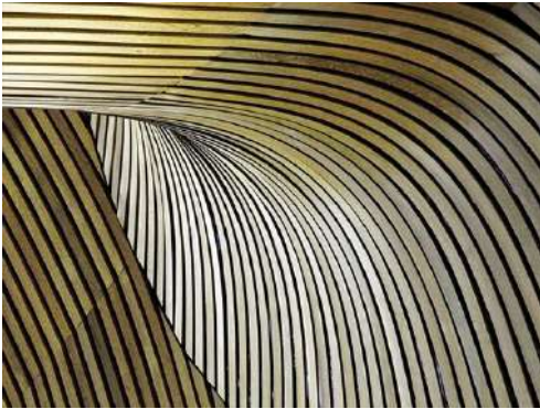
Wales Assembly Ceiling