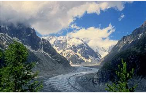
La Mare de Glace

The following pictures by Philip have been extracted from our archives and were entered as golds.