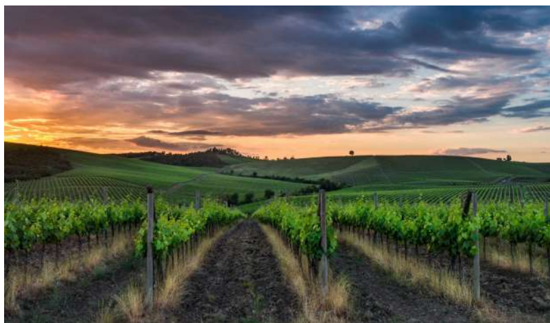
Vineyard at Sunset

It was a fabulous day and not one I'll forget in a hurry.