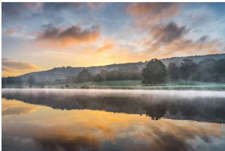
A Morning Mist in Chatsworth Park

Each year along with the eight categories they always run, there are special awards. This time around one of those awards was 'Capability Brown 300' to honour the three hundred years since his birth. I had entered three images taken again in Chatsworth Gardens and parkland in this award and I was absolutely delighted to find one of my images entitled 'A Misty Morning in Chatsworth Park' had come first.