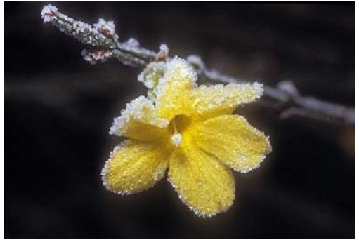
A Touch of Frost