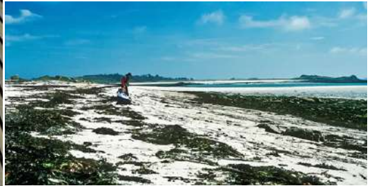
Lonely on Sampson